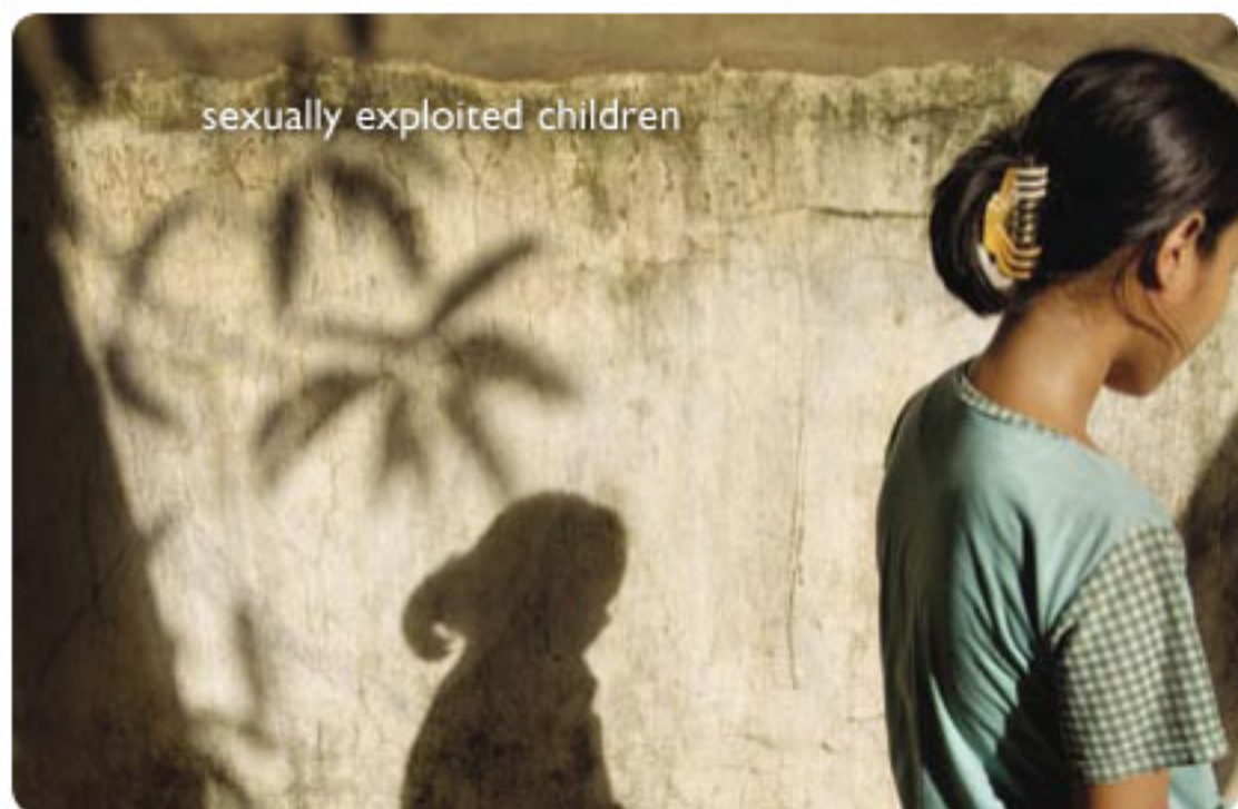
sexually exploited children

You'll help fund World Vision's efforts to help these precious children experience new life. Our drop-in centers offer essentials such as nutritious food, shelter, medical treatment, educational opportunities, and adult nurture in a safe environment. Recognizing that family is the best place for children to grow, we work to reunite them with family members or place them in loving foster homes whenever possible.